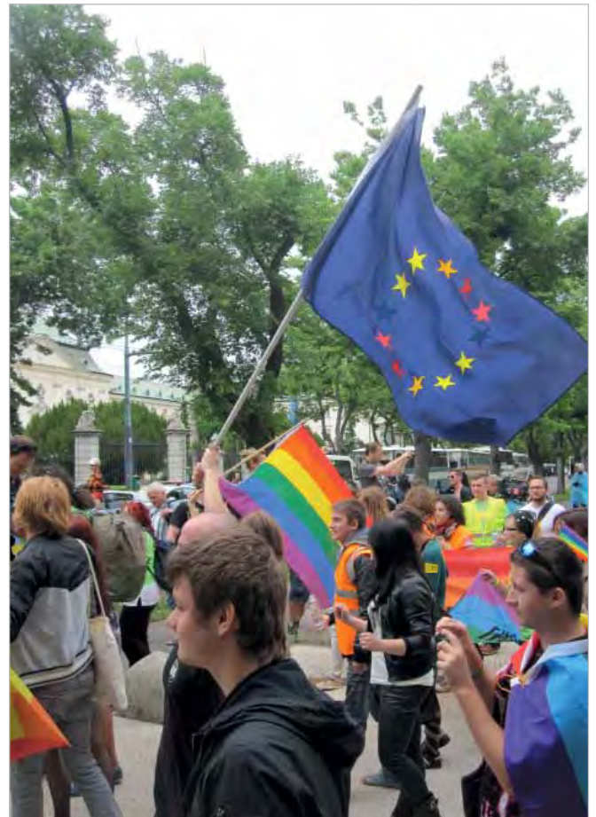
Demonstrators at the Bratislava field study