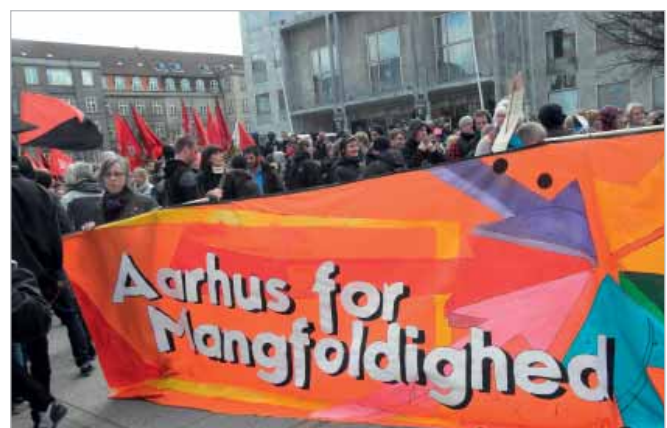
Demonstrators at the Aarhus field study

The theoretical frame of reference for the project work is built upon modern crowd research and draws in particular on research findings related to the Elaborated Social Identity Model (ESIM) of crowd behaviour that formulated explanations for the escalation of crowd conflict. The ESIM suggests that crowd events are characteristically encounters between groups during which crowd members act in accordance with their social identity.