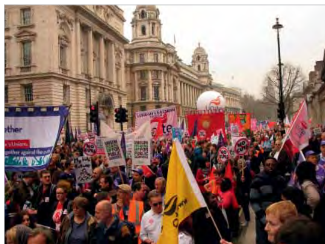
Demonstrators at the London field study