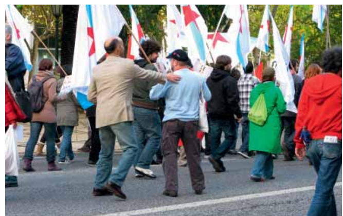
Team member approaching demonstrators during the Lisbon field study