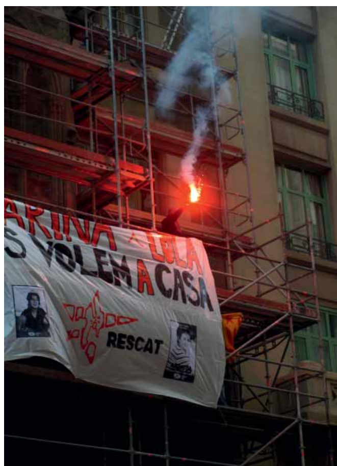
Demonstrators at the Barcelona field study

this “quiet” era, Noakes and Gillham (2006) describe a change in protest, where protesters no longer followed the co-operational “agreements” and became less predictable. Examples of this are the EU summit held in Amsterdam in 1997 and, more globally, the demonstrations against the WTO Ministerial Conference in Seattle in 1999, considered “the start of a new genre of protests” (Noakes & Gillham, 2006:98). Protesters thwarted police planning by appearing far earlier than expected and blocking access to the conference building, leading to a partial shutdown of the conference. Protesters using the “black bloc” tactic in Seattle (initially coming from protest groups in Germany) gained worldwide attention. Responding to this new approach on the protesters’ side, many