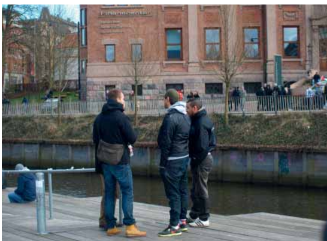
Team members conducting interviews during the Aarhus field study

During the field studies the following questions were therefore in focus.