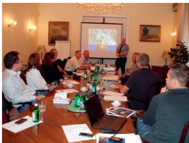
Briefing by host during the Budapest field study

The briefings continue. This includes information by the host and the host reference person, an overview on the theoretical background of the project, methodological issues and the context of the specific event and a briefing on safety matters (appendix F). Based on the collected information and the field study questions, the field study group develops its plan for observations and interviews, identifies what data will be gathered, in what way and by whom.