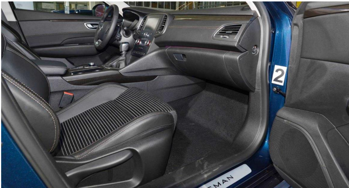
Figure 8. A Renault Talisman. The VIN is positioned unusually vertically in the space of the A-pillar. When the VIN is positioned vertically, dirt, water and service fluids do not cling to it as much.

With vehicles having a frame structure, the VIN is usually placed externally , on the bottom frame of the vehicle. It is normally found on the frame near the rear wheel, often covered in a protective paint, wax or asphalt compound. A VIN is also located externally in some vans, in the area of the front wheel. However, these positions are not too successful because the VIN is normally covered in mud in these places, and if we do not know exactly where to look for it, we will have great difficulty finding it. Furthermore, such positions are usually only accessible after the wheels are turned in one of the extreme directions (to the left, to the right) using the steering wheel. External identifiers are normally placed on the right side of the vehicle to ensure that access to the identifier is safe and that the examining person does not find themselves on the side with heavy road traffic. However, placing it towards the “pavement” may be problematic with respect to those models that are supplied by the manufacturers simultaneously to markets with right- and left-hand road traffic.