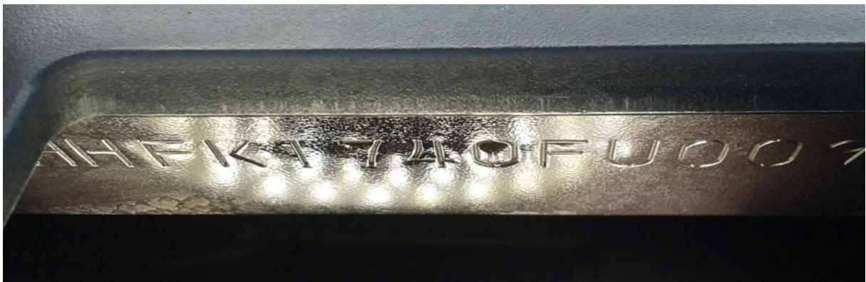
Figure 4. Overall, the identifier is visually inaccessible even following this dismantlement. Reading the VIN is very uncomfortable, and the inclined surface plays a role as well.