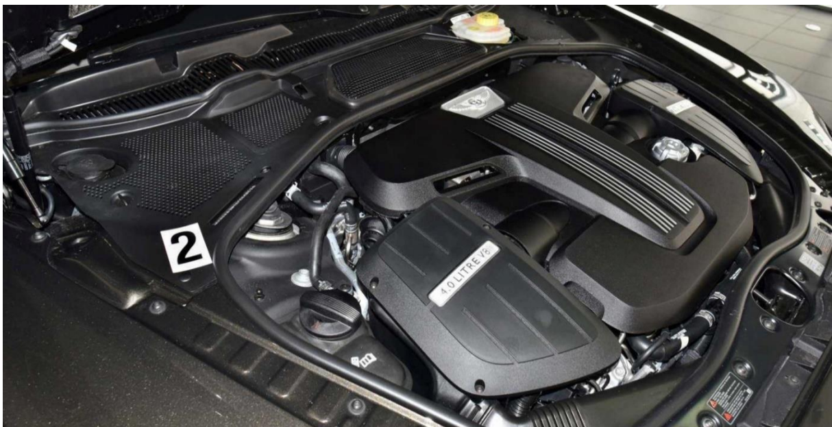
Figure 1. A standard VIN position in the engine compartment of a Bentley Continental GT vehicle. The VIN is easily visually accessible (to the right of number 2).

The basic identifier of a vehicle in automotive, police, forensic as well as administrative practice (vehicle registration and its use for the purposes of state administration) is a VIN ( Vehicle Identification Number ), which is defined in international standards. A VIN is a globally unique, unrepeatable identifier that is unique for each manufactured vehicle.