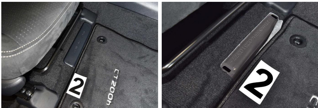
Figure 7. The VIN of a Lexus CT 200h vehicle standardly placed below the front passenger’s seat. The VIN is protected by a plastic guard against damage and soiling.

VINs in the engine compartment of older vehicles may be more fouled than in the interior or luggage compartment of the vehicle: there is greater moisture, dust levels, and the possibility of corrosion there as the engine is never entirely covered from its lower section, usually not at all. For the sake of protection against these types of physical and chemical effects, a protective transparent film is stuck over the VIN, having a double role: protection against the said external physical and chemical effects and against wilful interference by a person having an illegal reason to alter the VIN.