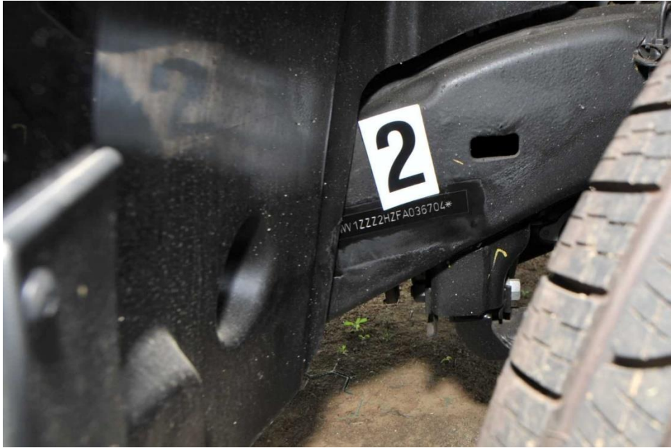
Figure 9. A Volkswagen Amarok. The VIN identifier is located outside the vehicle on its chassis part and is protected by a transparent cover label. Placing the VIN in this part of the vehicle is not too fortunate – comfortable for practical inspection (one has to bend down and, at the same time, turn the wheels), the vehicle chassis tends to be very heavily fouled, so one has to know exactly where to look for the identifier. After several years of operation, the identifier is severely corroded, so its legibility decreases abruptly.

In the engine compartment, German manufacturers (Audi, Bentley, BMW, VW, Škoda, Seat, etc.) cover VINs with self-adhesive transparent stickers that primarily protect the identifier from damage, fouling and corrosion and, simultaneously, warn secondarily that the VIN identifier also needs to be protected against any attempts to alter it illegally. On Land Rover / Range Rover vehicles, the self-adhesive transparent stickers have coloured warning edges that visibly show that it is an inviolable protective zone.