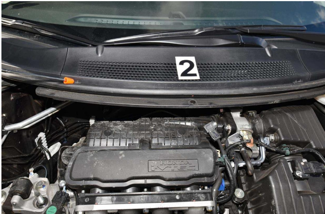
Figure 2. An example of a difficult-to-access VIN in a Honda Civic vehicle. For the identifier to be visually accessible, plastic parts must be expertly dismantled.