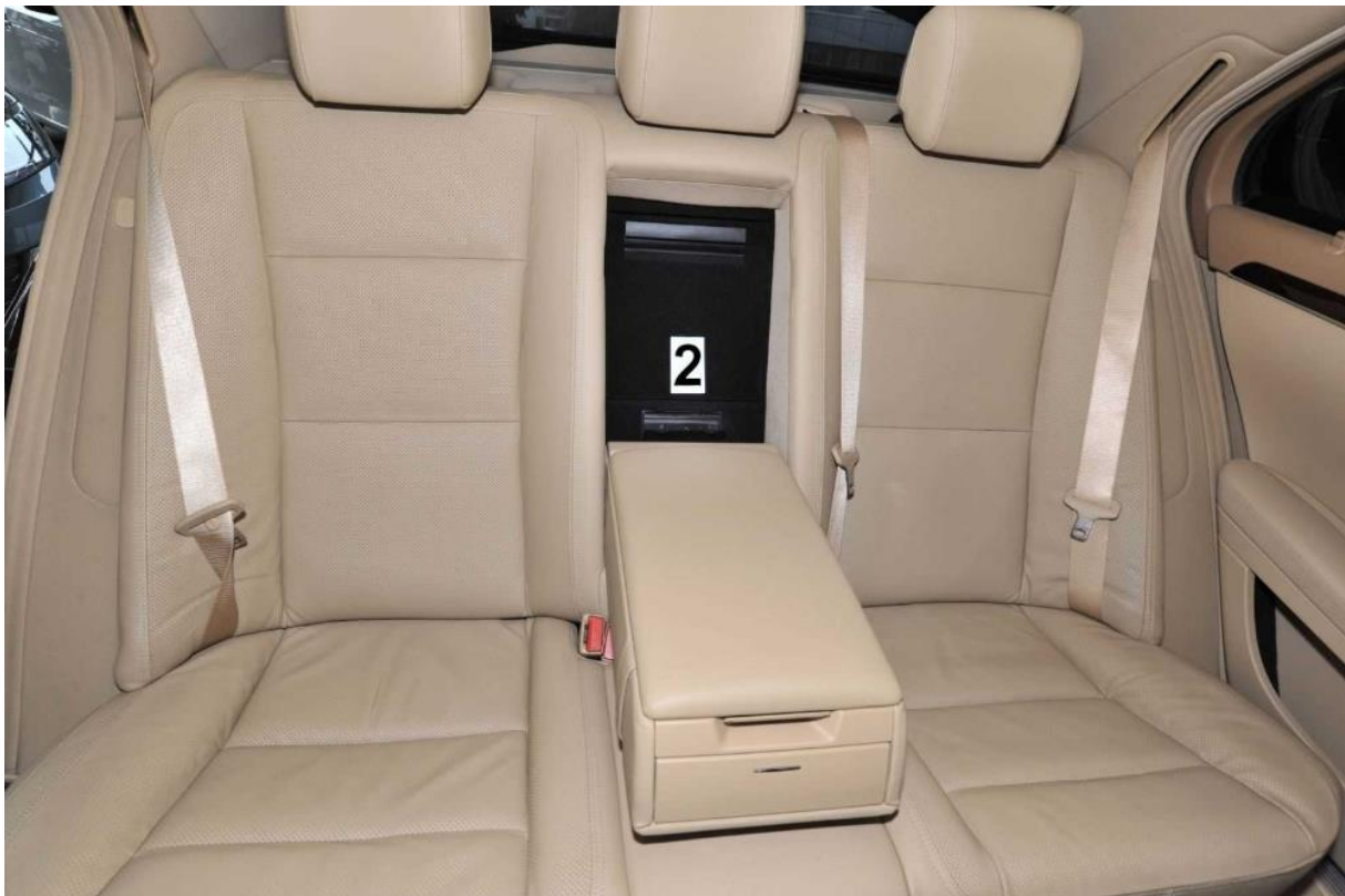
Figure 6. A VIN located in a non-standard way in a Mercedes-Benz S-class vehicle in the space behind the elbow rest of the rear seats. It occurs to hardly anyone to look for the identifier there. On the other hand, this space is clean, dust-free so the identifier is not exposed to the negative effects of ambient phenomena.

A VIN identifier can be positioned in the interior of a car or in its exterior . The term interior generally refers to the internal part of the vehicle space that is intended for passengers. As a rule, a VIN is placed in the floor under the front passenger's seat, on the inner bottom side of the body "frame", behind the rear support between the rear seats, etc. In the interior of a vehicle , identifiers are best protected from any external influences and, therefore, this location has been very frequent for positioning identifiers in recent years (e.g. in Hyundai vehicles) also because of the fact that in most cases the VIN is very easily accessible (for instance, it is not necessary to take items out of the luggage compartment where it is usually hidden under a removable bottom).